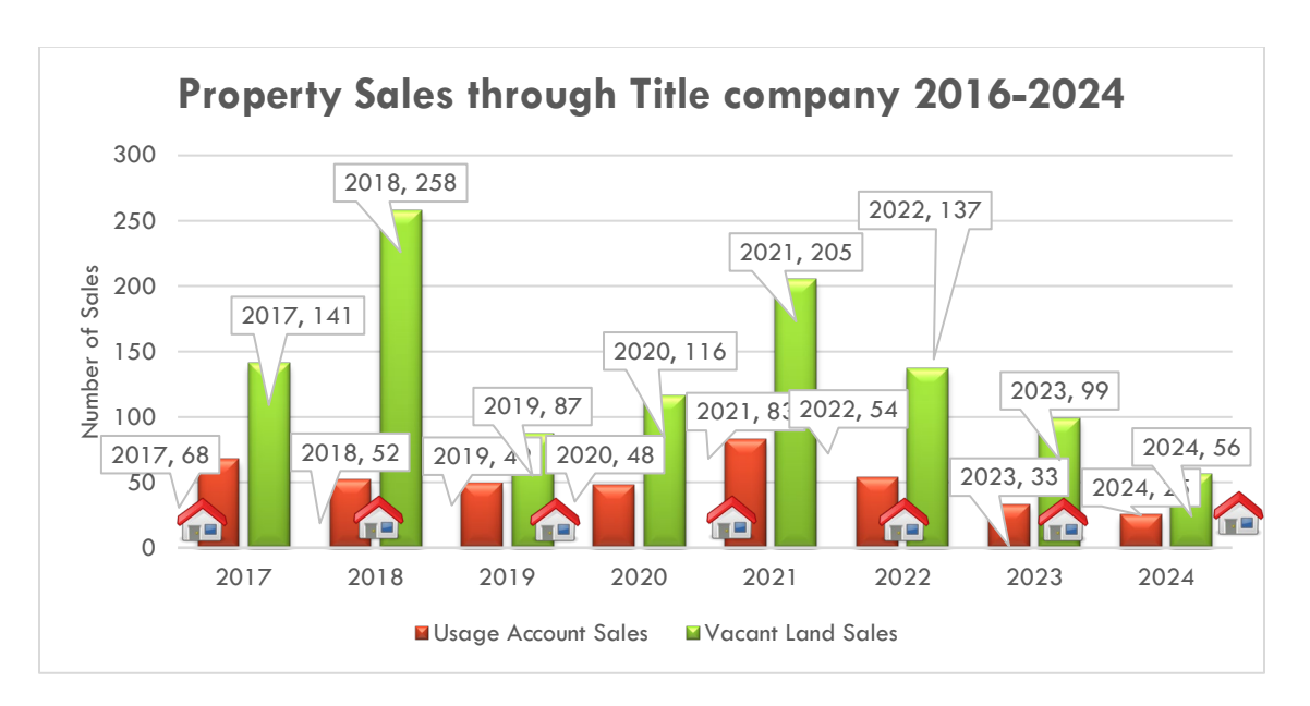
October - 2024- Property Sales: 5 - Homes, 9 - Lots

October - 2024 - Other Sales Statistic Including Name Changes Only